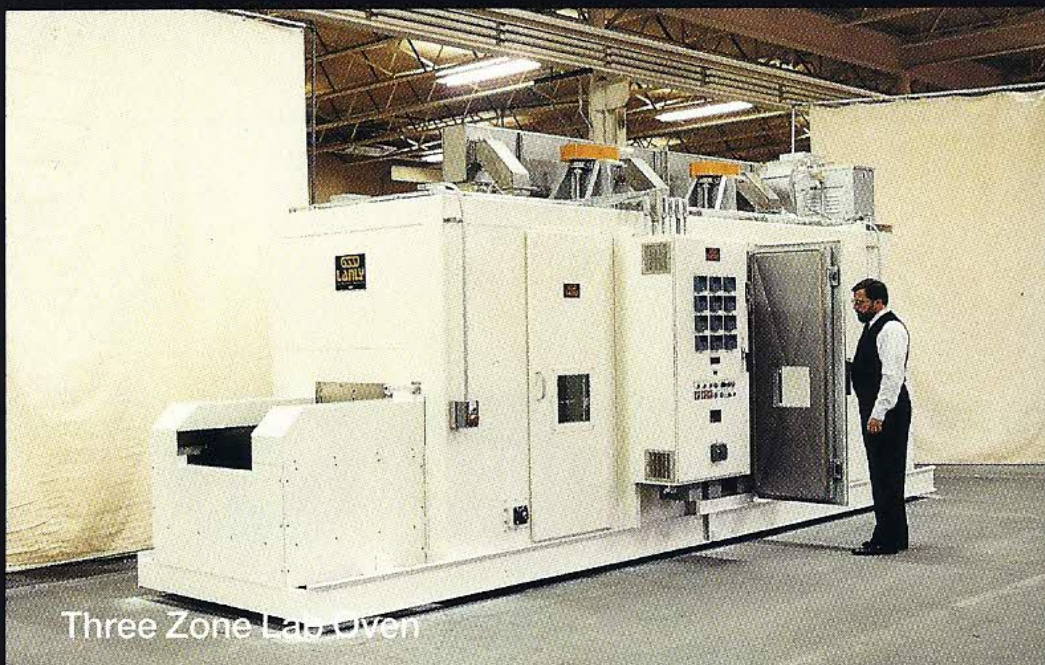
Three Zone Lab Oven