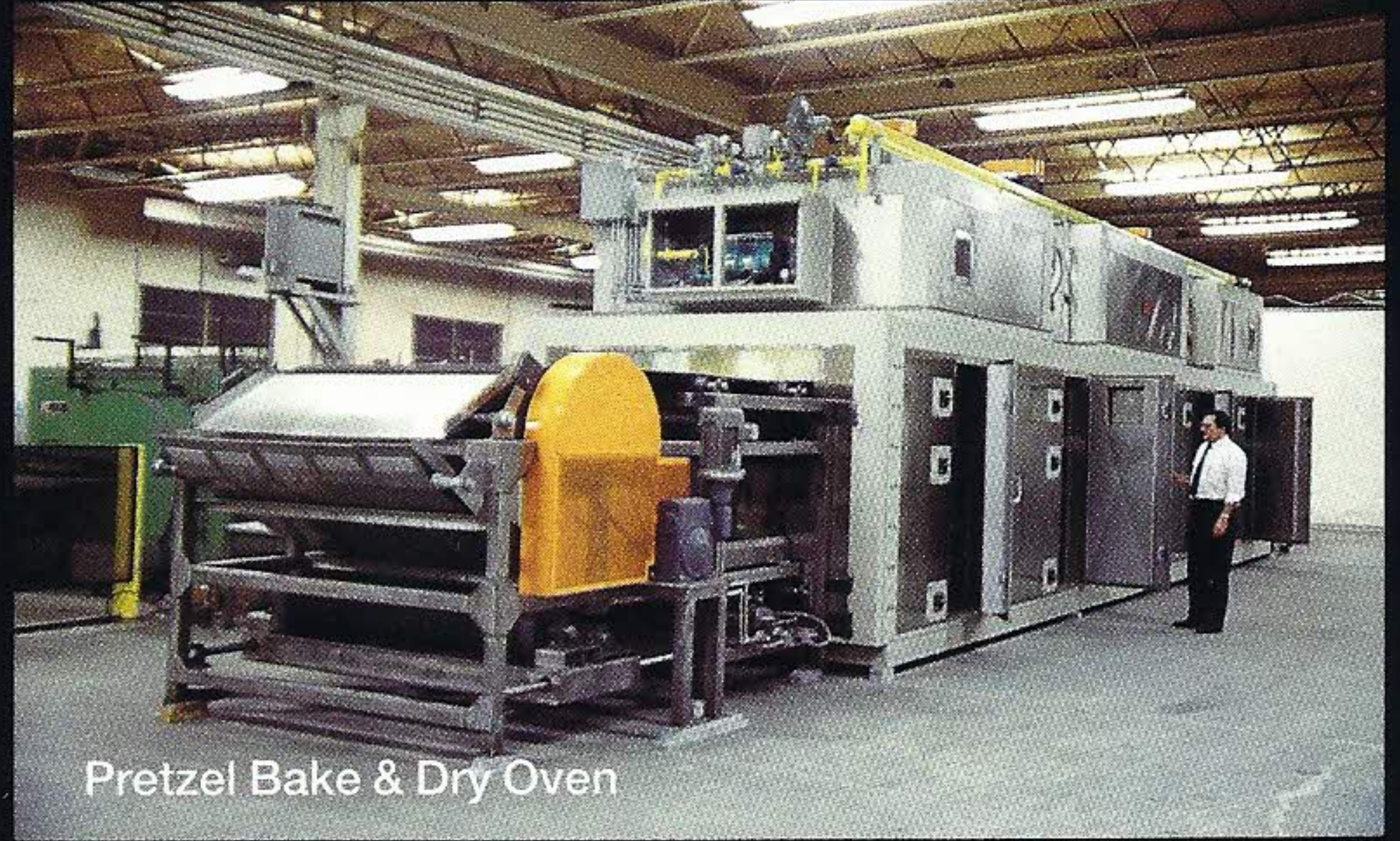
Pretzel Bake & Dry Oven