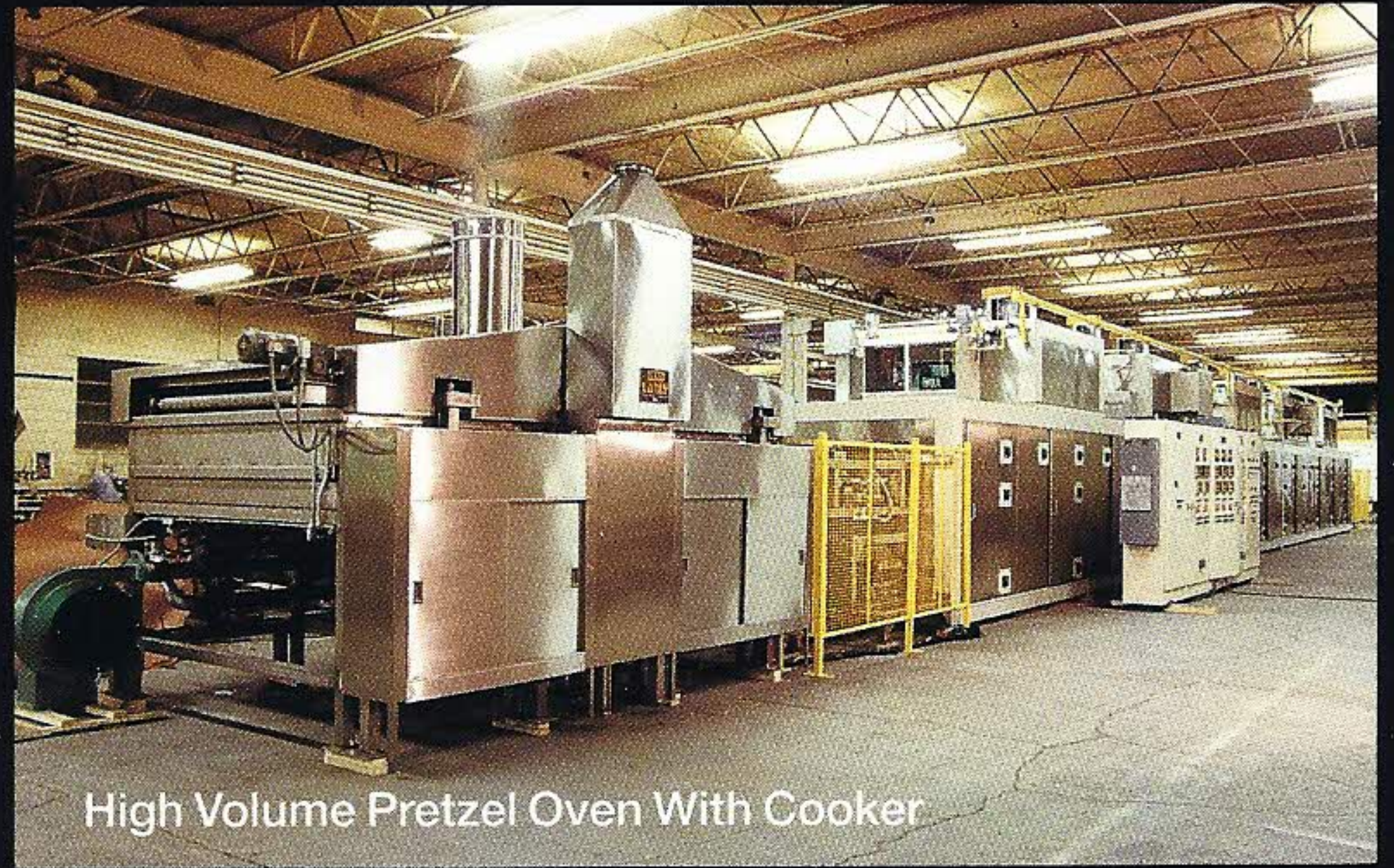
High Volume Pretzel Oven With Cooker