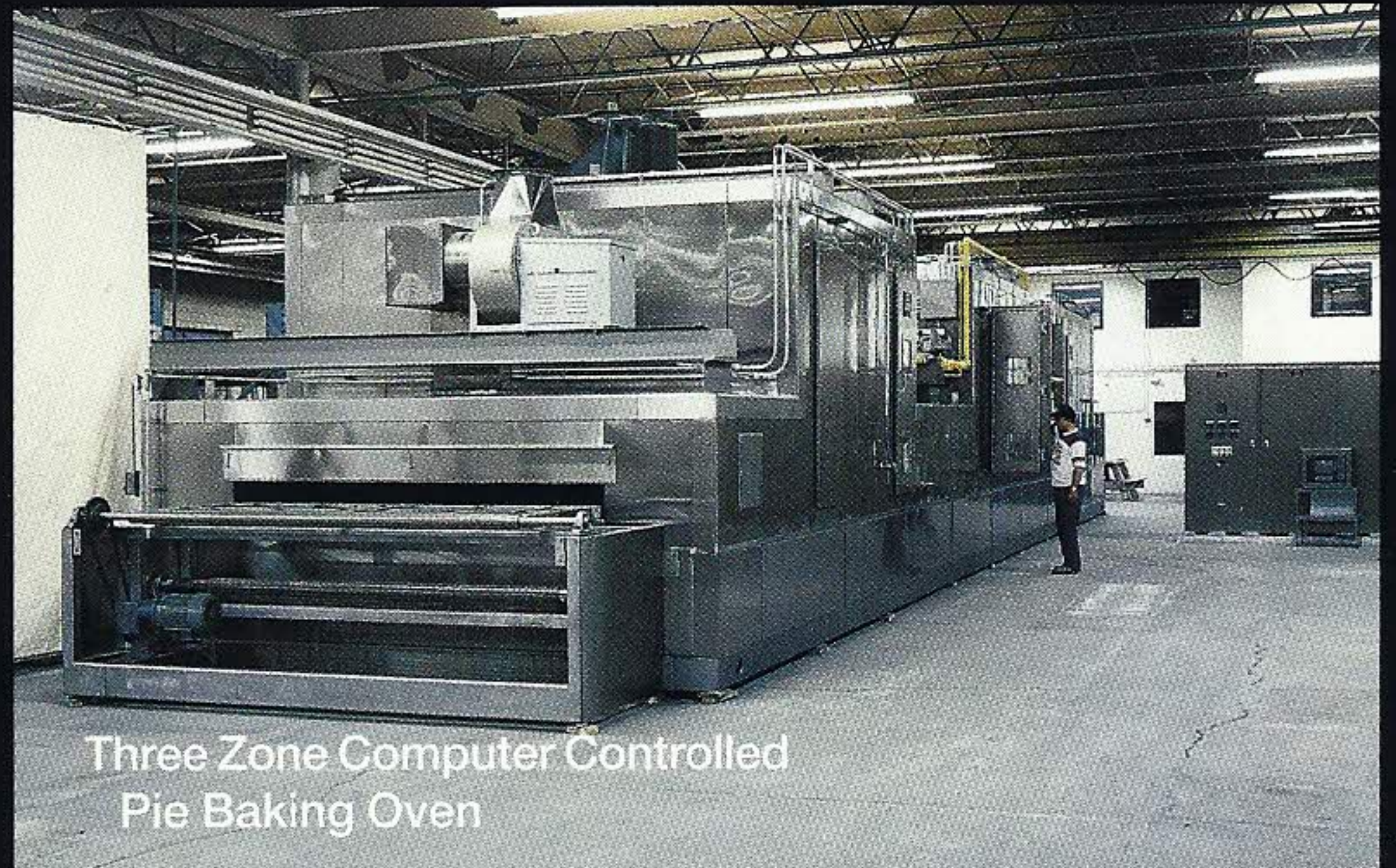
Three Zone Computer Controlled Pie Baking Oven