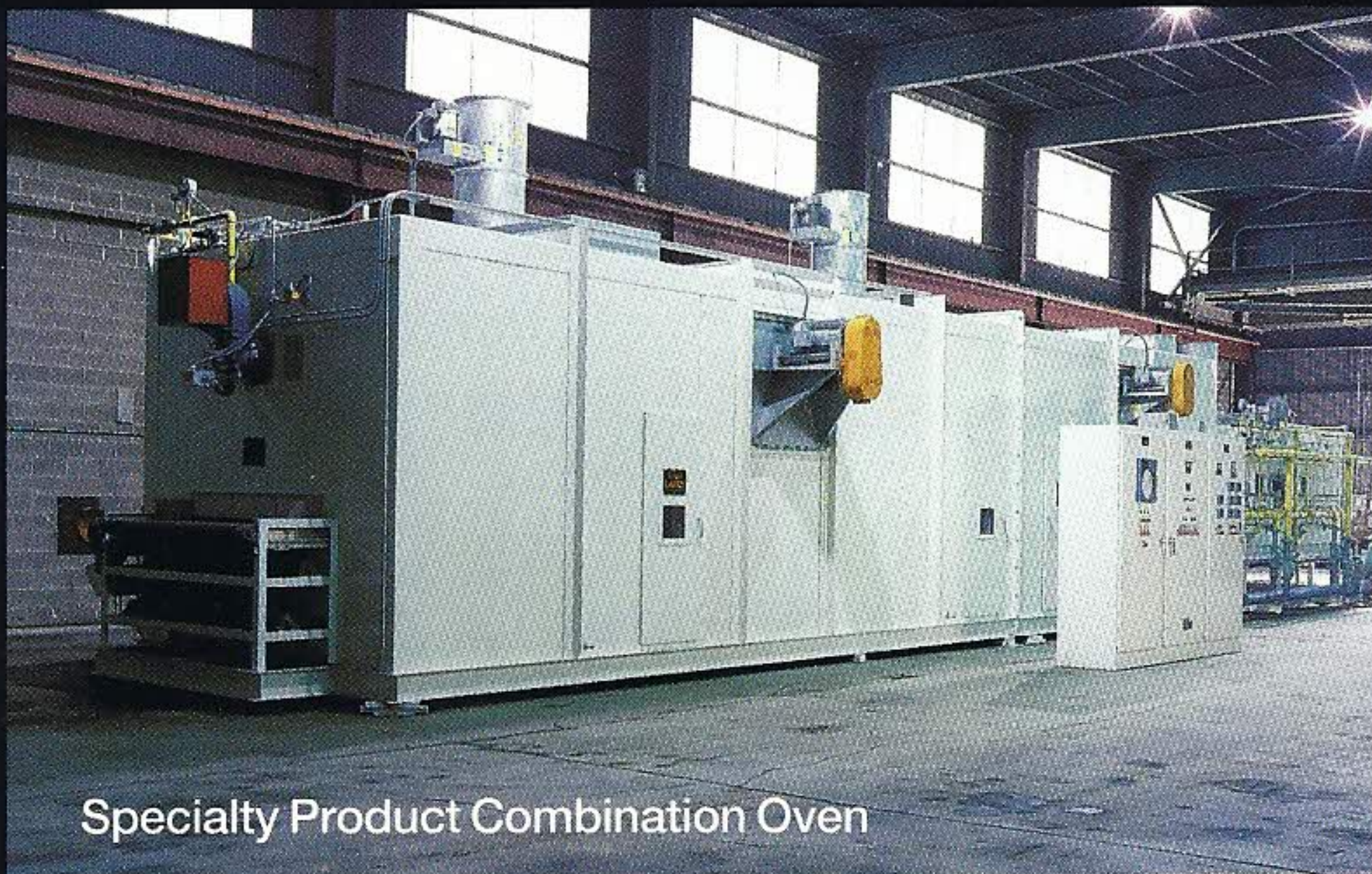
Specialty Product Combination Oven